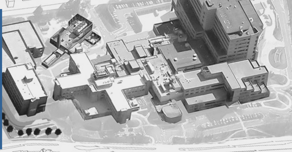
Campus Map with Outpatient Pavilion Expansion